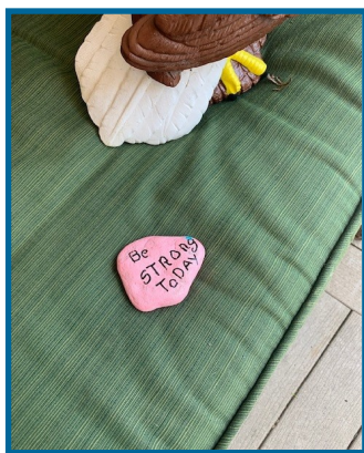
A patient's simple reminder for the day