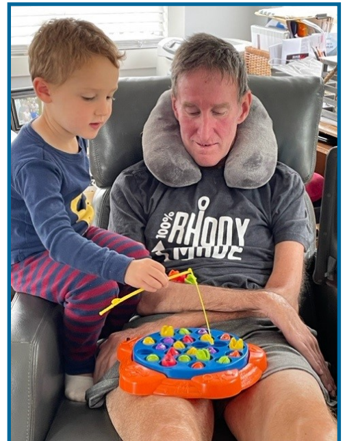
Fishing lessons with Papi